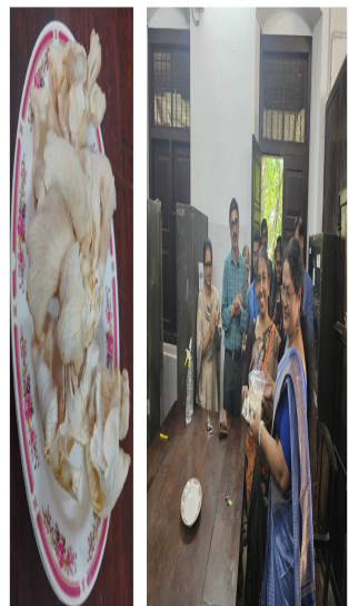
Principal gifting first harvest to Vice Principal